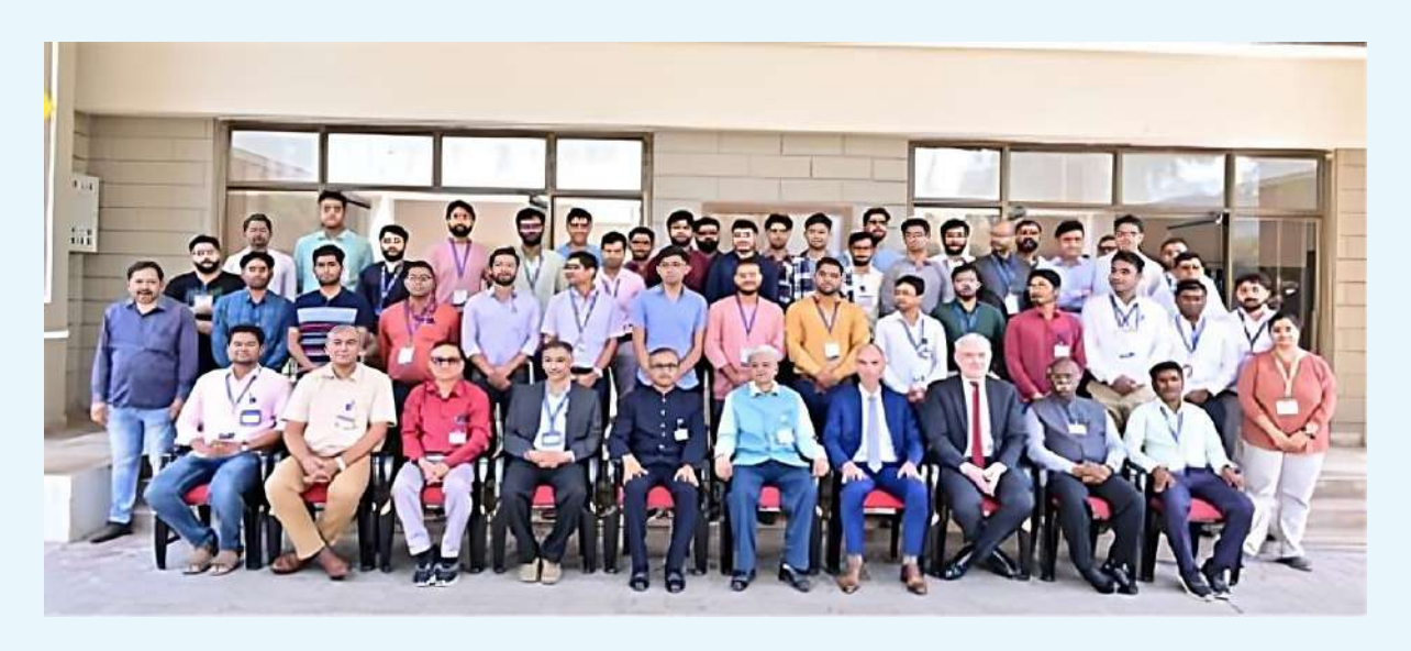
Participants of the course with dignitaries